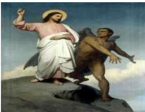
Temptations given to Jesus