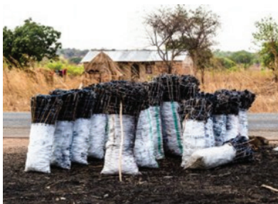
People burning charcoal