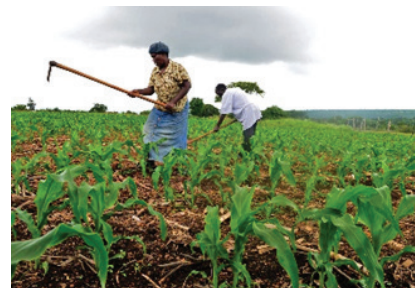
People growing crops