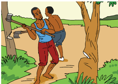
People cutting trees