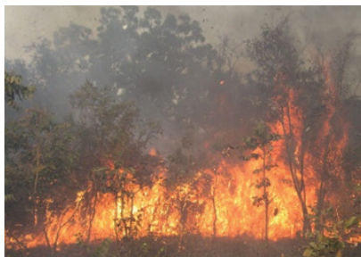
People burning bush