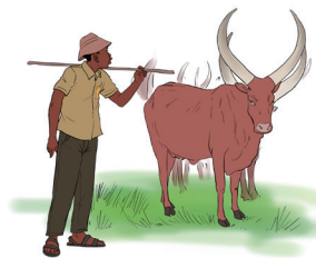
People cutting trees